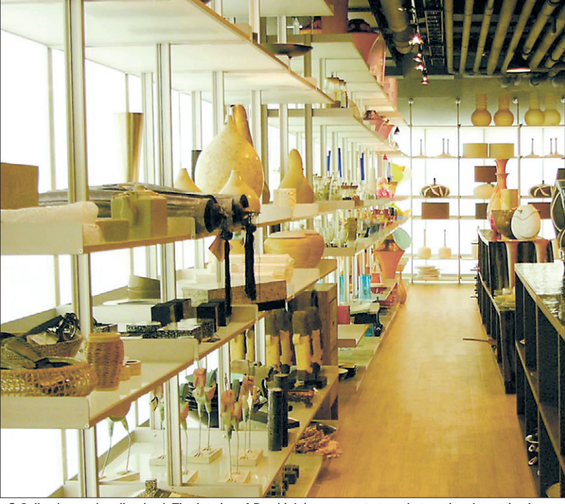
S-Gallery's merchandise (top). The interior of Dar (right), a concept store that carries decorative items