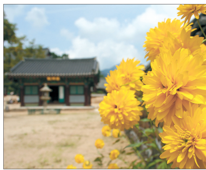
PHOTO CHALLENGE — Spring — Spring is in the air. In the never ending cycle of life, spring is not really a new beginning but a continuation of the vibrancy that was temporarily put into hibernation over the winter.

Another myth is that you are a better photographer with film. Film is defi-nitely a harder medium to work with. Film photographers need to trust their ability to get the shot, but digital offers the benefit of instant feedback.